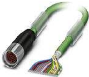
Cable plug in molded plastic, Length: 5 m, Color of outer sheath: green

Please be informed that the data shown in this PDF Document is generated from our Online Catalog. Please find the complete data in the user's documentation. Our General Terms of Use for Downloads are valid ( http://phoenixcontact.com/download )