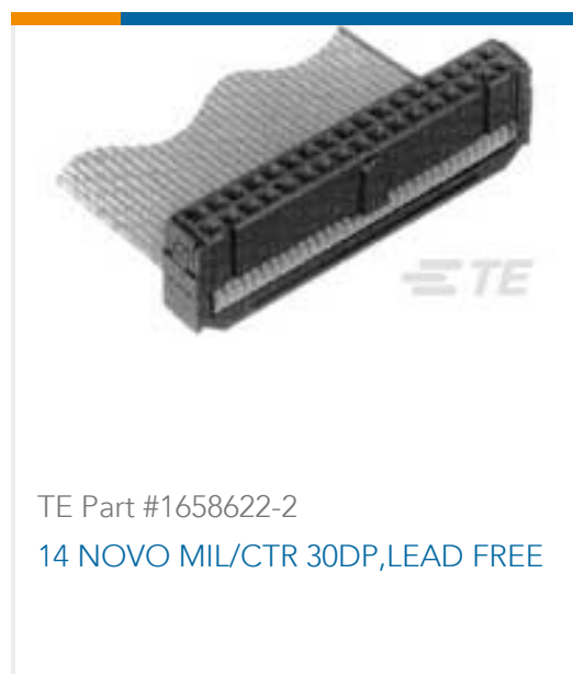
TE Part #1658622-2 14 NOVO MIL/CTR 30DP, LEAD FREE