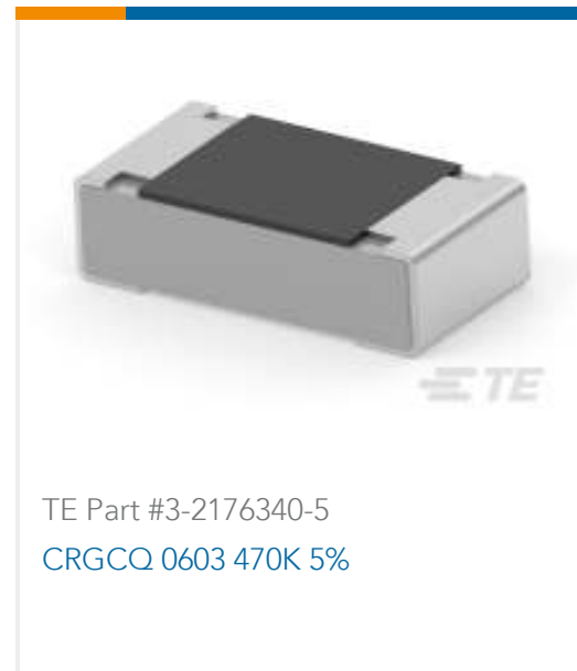
TE Part #3-2176340-5 CRGCQ 0603 470K 5%