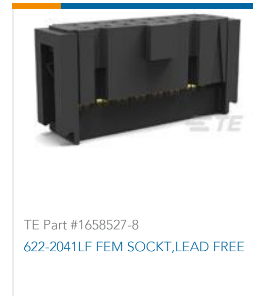
TE Part #1658527-8 622-2041LF FEM SOCKET, LEAD FREE