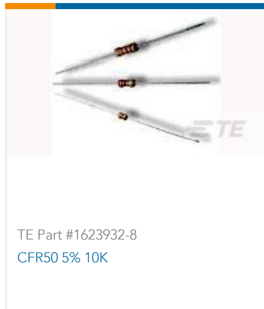
TE Part #1623932-8 CFR50 5% 10K