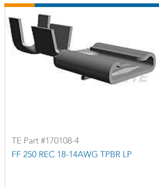
TE Part #170108-4 FF 250 REC 18-14AWG TPBR LP