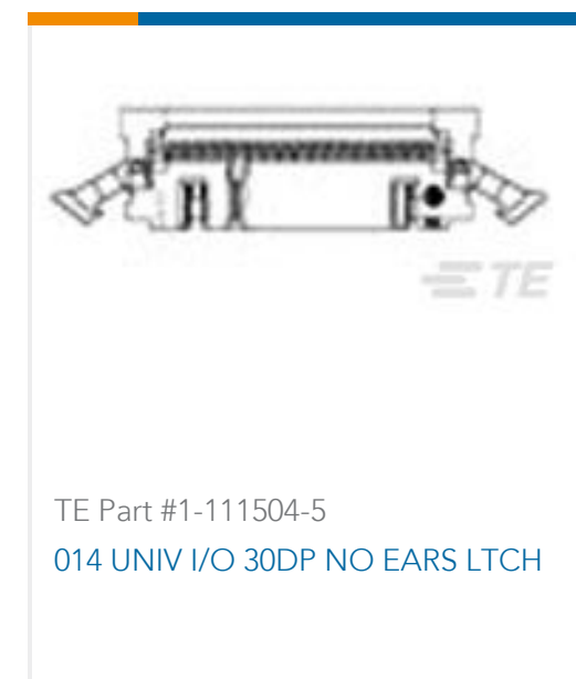
TE Part #1-111504-5 014 UNIV I/O 30DP NO EARS LTCH