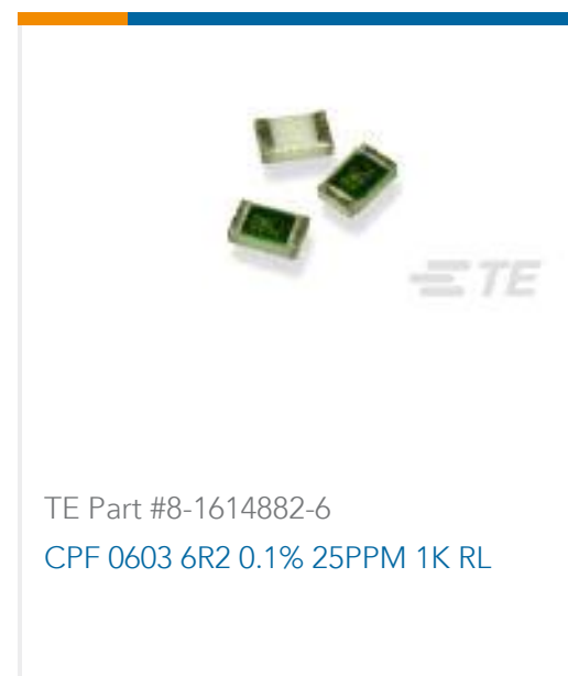
TE Part #8-1614882-6 CPF 0603 6R2 0.1% 25PPM 1K RL