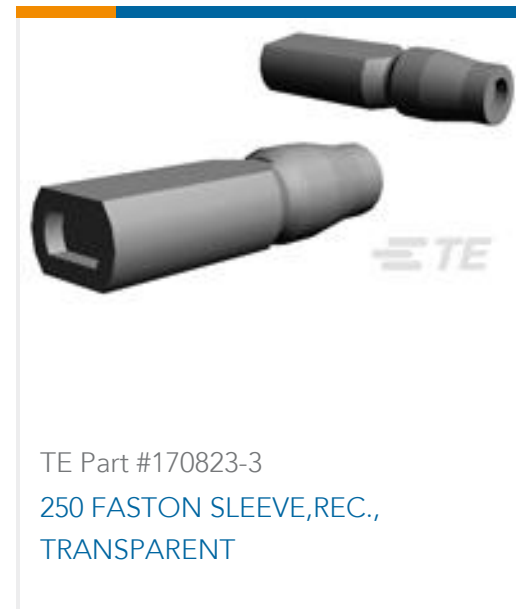
TE Part #170823-3 250 FASTON SLEEVE, REC., TRANSPARENT