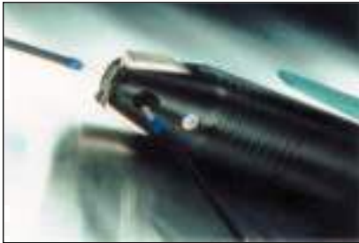
PC 24 - 14 H Close up View

Hand-crimper Trapezoid crimping Side and front insertion Universal - die Range 24-14 AWG (0.25-2.50 mm 2 ) Length: 7.9 inches (200 mm) Weight: 35.2 ounces (1000 g) Pressure: 58 psi (4 bar)