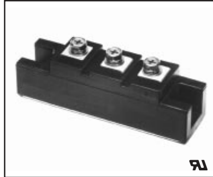
CD411230, CD411630 Dual Diode POW-R-BLOK™ Modules 30 Amperes/1200-1600 Volts