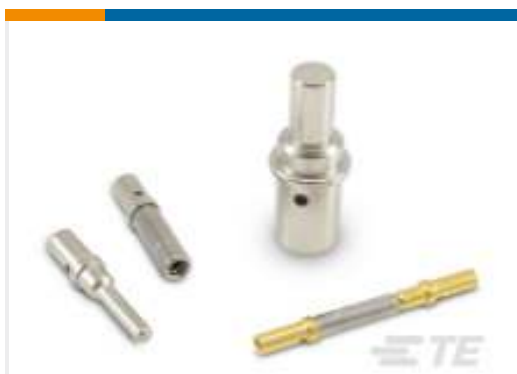
TE Part #0462-201-16141 DEUTSCH Solid Contacts