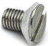
Sealing screw, for IP65 protection

Sealing screw - HC-D 7-DS-IP65 - 1686229