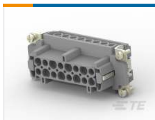
TE Part # T2040162201-000 HE-016-F