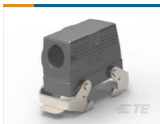
TE Part # T1250162132-000 H16B-TSB-M32