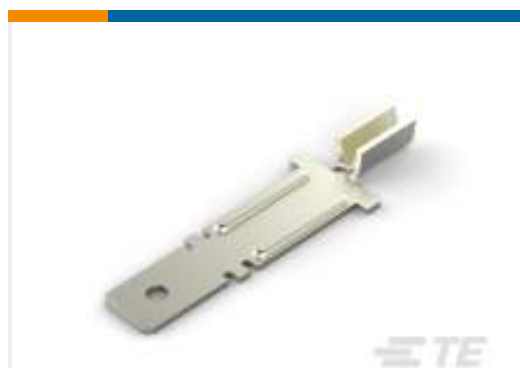
TE Part #1742583-1 FASTON 312 TAB NPST