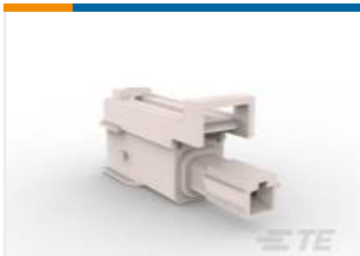
TE Part #1-2345728-1 Power Versa-Lock PLUG, 1X1 KEY A