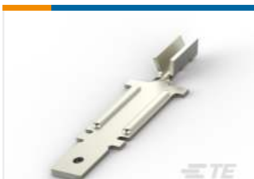
TE Part #1742550-1 250 FASTON, TAB, 20-15 AWG, NPST