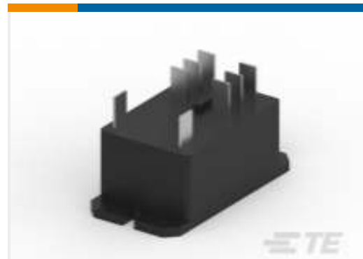
TE Part #1-1393212-6 T92S7D22-22