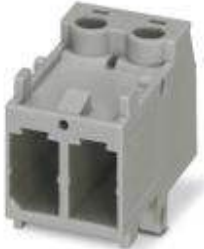
Dummy module, for panel mounting plug-in connector

Please be informed that the data shown in this PDF Document is generated from our Online Catalog. Please find the complete data in the user's documentation. Our General Terms of Use for Downloads are valid ( http://download.phoenixcontact.com )