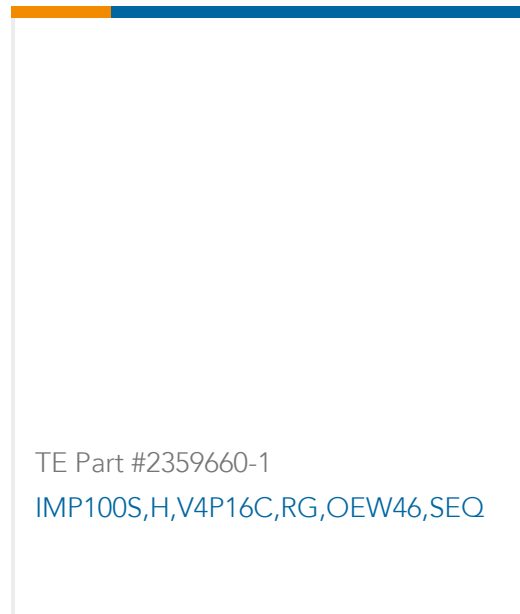
TE Part #2359660-1 IMP100S,H,V4P16C,RG,OEW46,SEQ