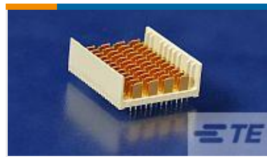
TE Part #6469287-1 HM-ZD 4PR HDR 96P, 5.3