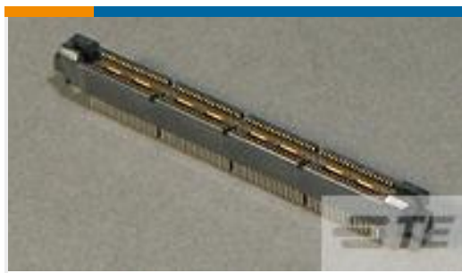
TE Part #5767006-4 MICT,R/APLUG,152,ASY,.025,.062