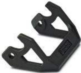
Single locking latch for B6 housing, HC-EVO....AL and HC-STA....AL

Please be informed that the data shown in this PDF Document is generated from our Online Catalog. Please find the complete data in the user's documentation. Our General Terms of Use for Downloads are valid ( http://phoenixcontact.com/download )