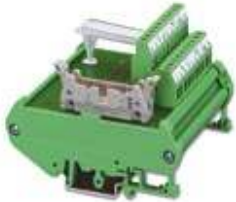
VARIOFACE input module, 16 channels for Siemens SIMATIC® S5-100U

Please be informed that the data shown in this PDF Document is generated from our Online Catalog. Please find the complete data in the user's documentation. Our General Terms of Use for Downloads are valid ( http://phoenixcontact.com/download )