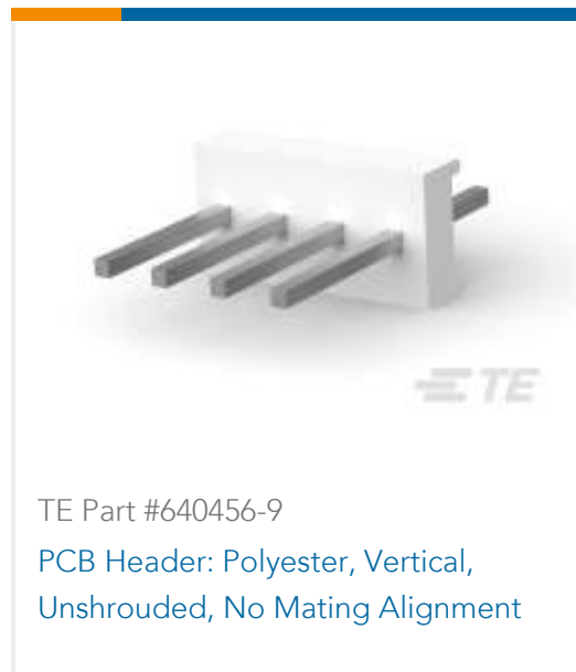
TE Part #640456-9 PCB Header: Polyester, Vertical, Unshrouded, No Mating Alignment