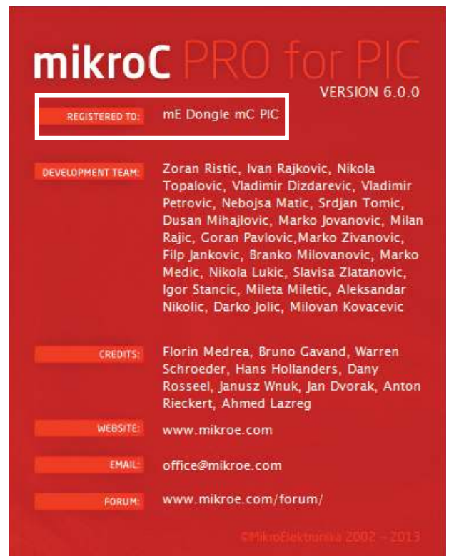
Figure 1-2: mikroC PRO for PIC® About Window