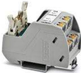
VARIOFACE Professional (VIP) board for the ROC800 controller

Please be informed that the data shown in this PDF Document is generated from our Online Catalog. Please find the complete data in the user's documentation. Our General Terms of Use for Downloads are valid ( http://phoenixcontact.com/download )