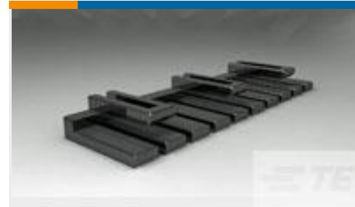
TE Part #1-1969443-0 EP 2.5 TPA Retainer, 10 Pos