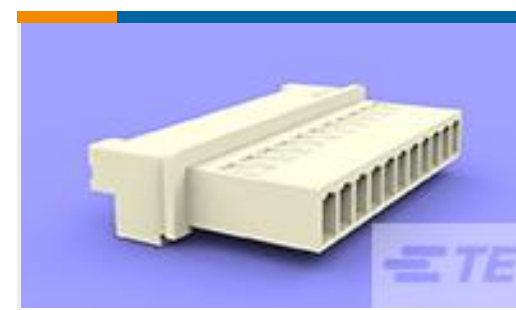
TE Part #1969588-2 HSG, REC, FREE-HANGING, SINGLE ROW, EP2.5