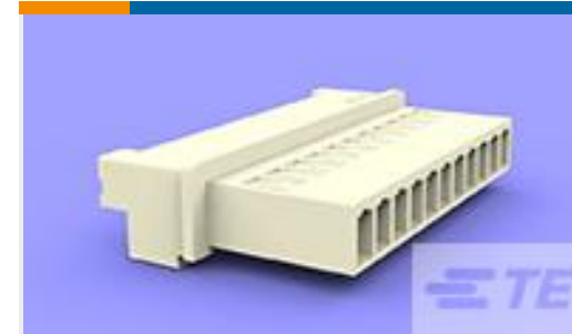
TE Part #1969588-3 HSG, REC, FREE-HANGING, SINGLE ROW, EP2.5