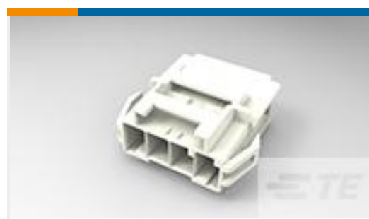
TE Part #1-1971772-4 PTL 1X4 CAP PANEL MT STD TEMP KEY A NAT