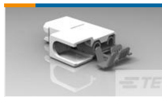
TE Part #521411-2 ULTRA-POD 250 ASY REC 22-18 AWG TPBR