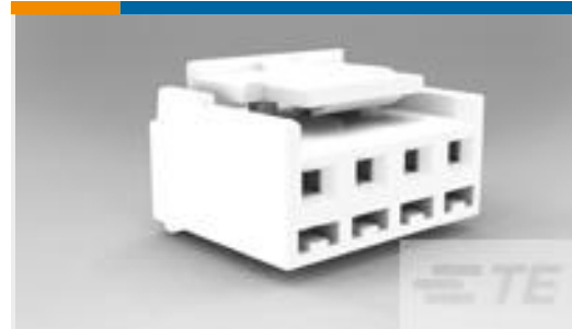
TE Part #2132781-9 09P EP-II HOUSING, NATURAL