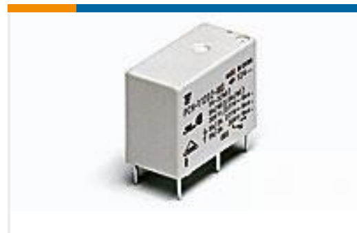
TE Part #1461350-6 PCH-124D2M,000