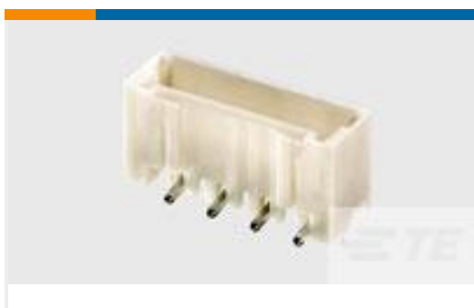
TE Part #1-292231-2 1.5 MINI CT SGL V SMT W/O BOSS