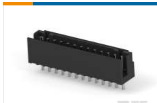
TE Part #292161-8 CT 2mm Post Header Asmbly: Box V DIP