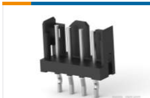
TE Part #1-292161-5 CT 2mm Post Header Assembly with Kink - Vertical