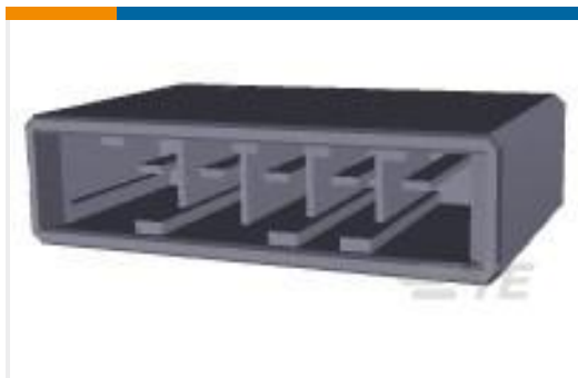
TE Part #2-316132-3 DYNAMIC D-3200 HDR ASSY 5P V