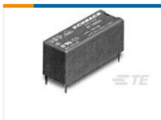
TE Part #4-1393224-9 RY211024