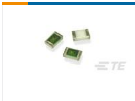
TE Part #1676385-2 RN 0805 5K11 0.1% 10PPM 1KRL