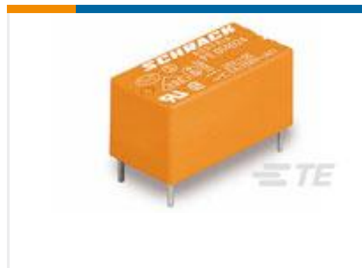
TE Part #1393219-3 PE014005