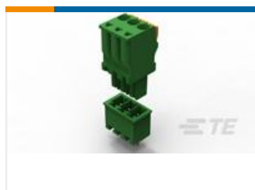
TE Part #1986693-2 STR PLUG SPRING TYPE LH 2P, 3.50 mm