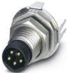
Sensor/actuator flush-type plug-in connector, plug, 5-pos., DeviceNet, M8, rear/screw mounting with M10 fastening thread, with straight solder connection

Please be informed that the data shown in this PDF Document is generated from our Online Catalog. Please find the complete data in the user's documentation. Our General Terms of Use for Downloads are valid ( http://download.phoenixcontact.com )