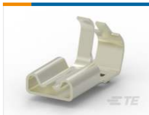
TE Part # 2238142-1 250 FASTON, FLAG, REC., 22-16 AWG, NPST