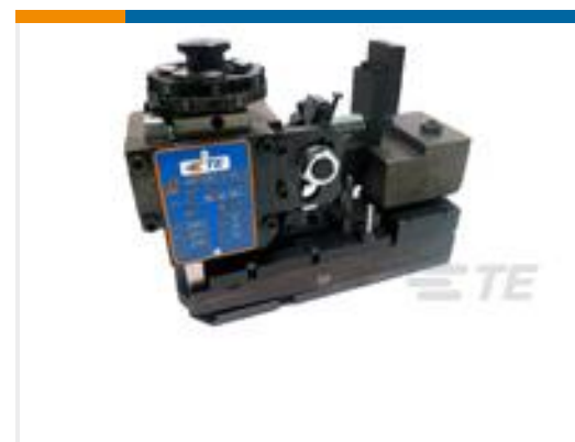
TE Part # 1385580-1 HINGEBAR EMPO200TABLOCK2100