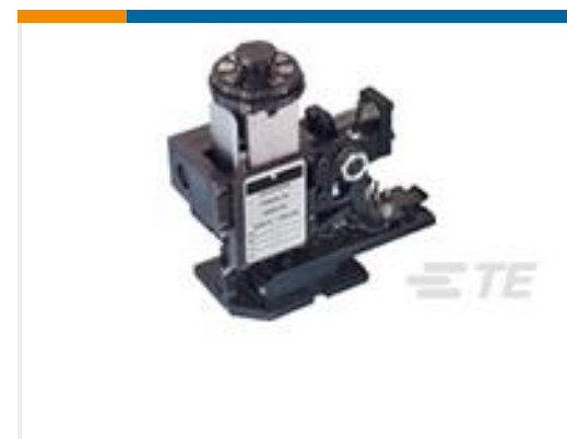
TE Part # 1852646-1 EFHBPO200TABLOCK.2100 LM/G