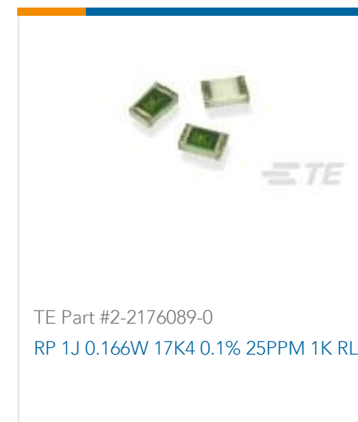
TE Part #2-2176089-0 RP 1J 0.166W 17K4 0.1% 25PPM 1K RL