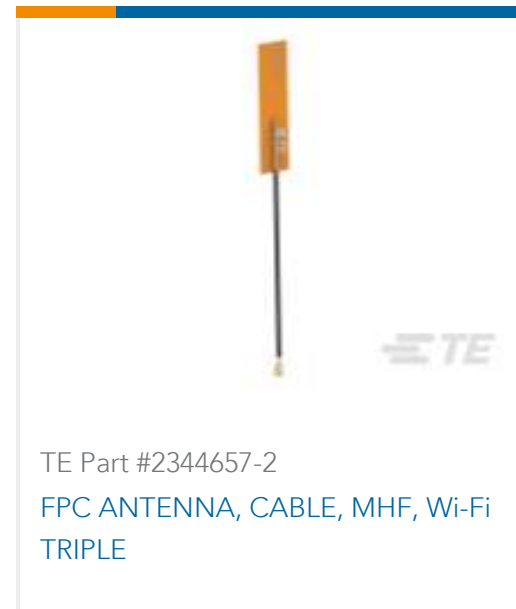
TE Part #2344657-2 FPC ANTENNA, CABLE, MHF, Wi-Fi TRIPLE