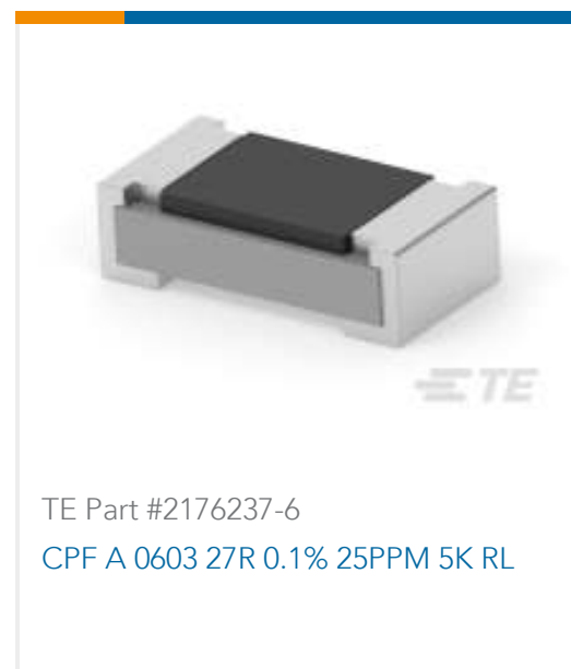
TE Part #2176237-6 CPF A 0603 27R 0.1% 25PPM 5K RL