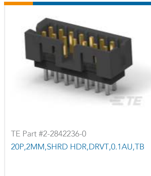
TE Part #2-2842236-0 20P,2MM,SHRD HDR,DRV,0.1AU,TB