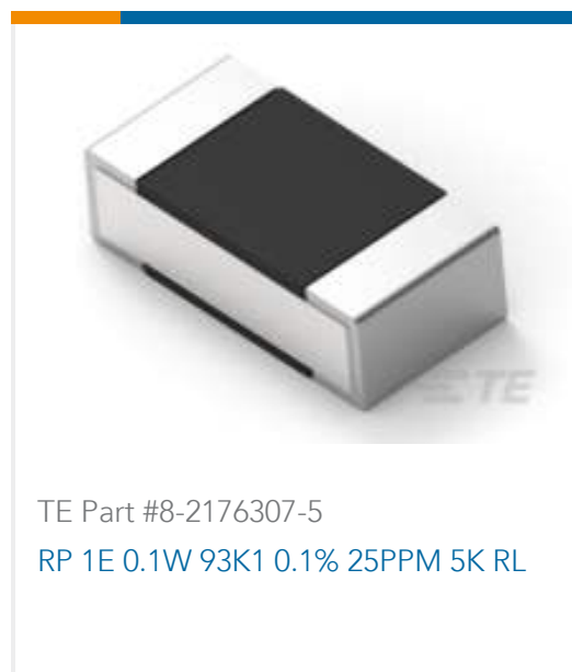
TE Part #8-2176307-5 RP 1E 0.1W 93K1 0.1% 25PPM 5K RL