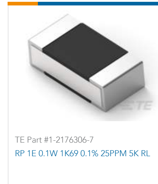
TE Part #1-2176306-7 RP 1E 0.1W 1K69 0.1% 25PPM 5K RL