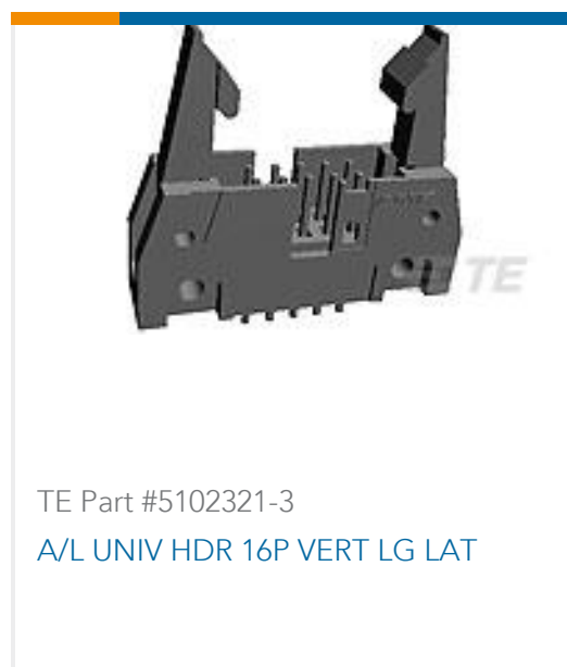
TE Part #5102321-3 A/L UNIV HDR 16P VERT LG LAT