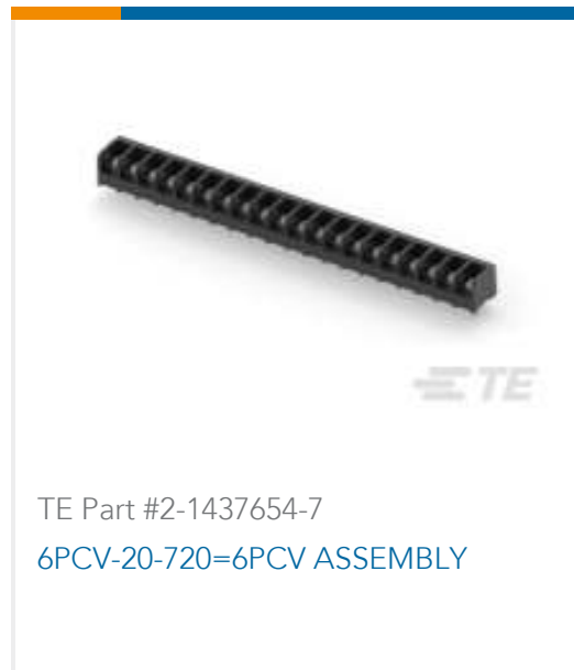
TE Part #2-1437654-7 6PCV-20-720=6PCV ASSEMBLY