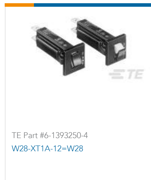
TE Part #6-1393250-4 W28-XT1A-12=W28