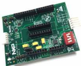
OMA100X-SHLD-EVB Orderable part number: OMA100X-SHLD-EVB An Arduino Uno R3 Interface board