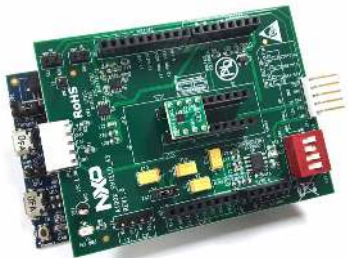
A1006 Demo-Dev Kit Orderable Part Number: Kit-A1006-SHIELD