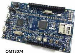
OM13074 Orderable part number: OM13074 LPCXpresso board for LPC11U37H