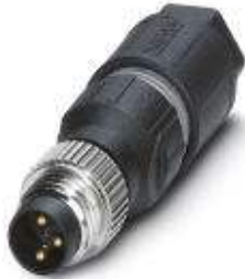
Sensor/actuator connector, male connector, straight, 3-pos., M8, QUICKON-ONE, metal knurl, maximum cable diameter of 5.0 mm

Please be informed that the data shown in this PDF Document is generated from our Online Catalog. Please find the complete data in the user's documentation. Our General Terms of Use for Downloads are valid ( http://download.phoenixcontact.com )