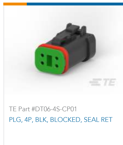
TE Part #DT06-4S-CP01 PLG, 4P, BLK, BLOCKED, SEAL RET