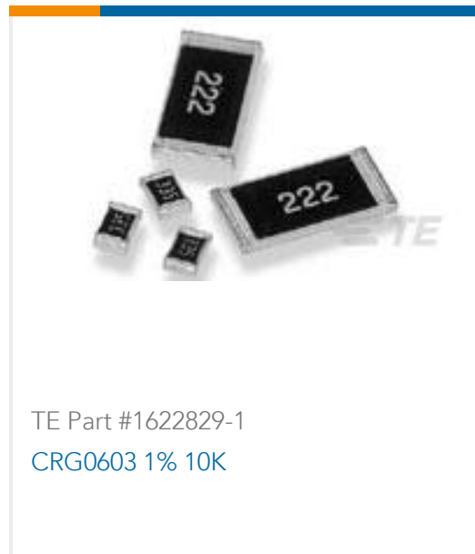
TE Part #1622829-1 CRG0603 1% 10K