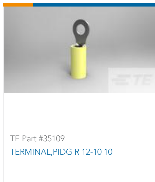
TE Part #35109 TERMINAL,PIDG R 12-10 10