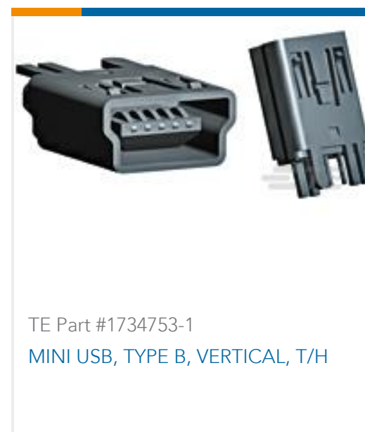
TE Part #1734753-1 MINI USB, TYPE B, VERTICAL, T/H