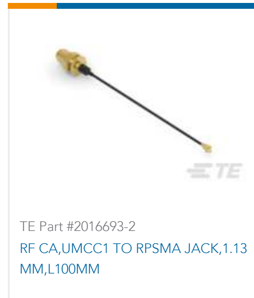
TE Part #2016693-2 RF CA,UMCC1 TO RPSMA JACK,1.13 MM,L100MM