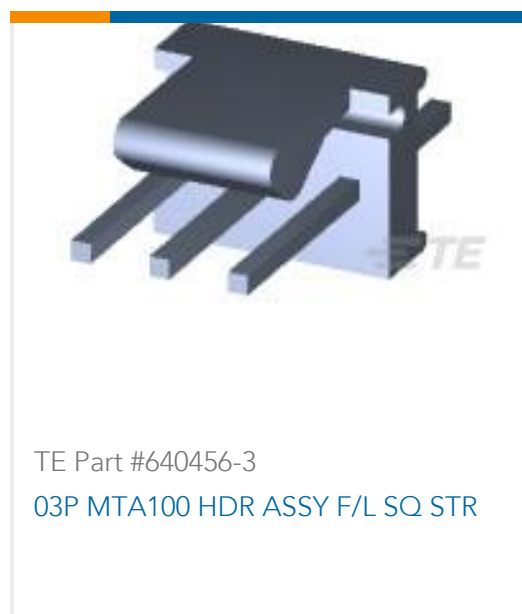
TE Part #640456-3 03P MTA100 HDR ASSY F/L SQ STR