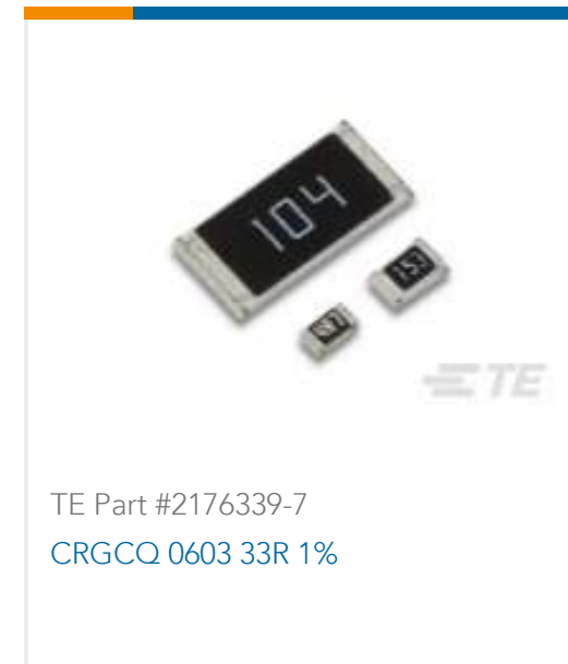
TE Part #2176339-7 CRGCQ 0603 33R 1%