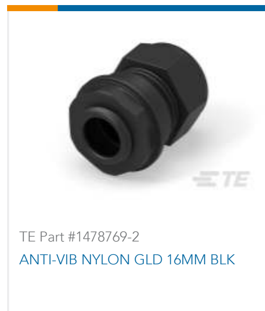
TE Part #1478769-2 ANTI-VIB NYLON GLD 16MM BLK