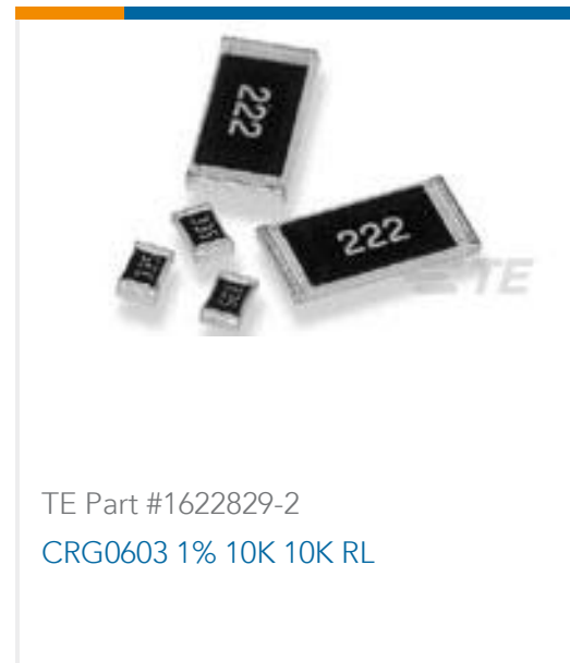
TE Part #1622829-2 CRG0603 1% 10K 10K RL