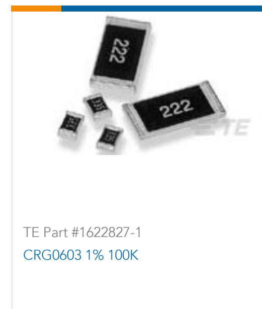
TE Part #1622827-1 CRG0603 1% 100K