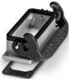
HEAVYCON panel mounting base HV10/16, with single locking latch, height 27 mm

Please be informed that the data shown in this PDF Document is generated from our Online Catalog. Please find the complete data in the user's documentation. Our General Terms of Use for Downloads are valid ( http://phoenixcontact.com/download )