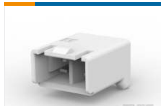
TE Part #1376382-1 STD Temp Power Key Header