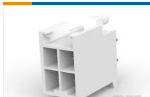
TE Part #179849-1 STD Temp Power Double Lock Header