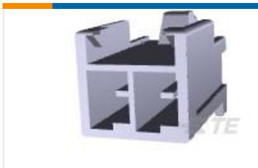
TE Part #179838-1 AMP POWER D/LOCK T/HDR ASSY 2P