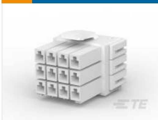
TE Part # 177905-1 POWER DBL LOCK PLUG HSG 12P