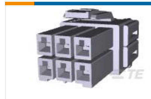
TE Part #177901-1 POWER DBL LOCK PLUG HSG 6P