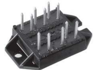
Pin arrangement see outlines