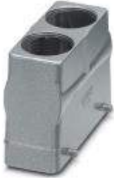
HEAVYCON B24 sleeve housing, for double locking latch, height: 76 mm, with 2 x M40 thread, straight cable outlet

Please be informed that the data shown in this PDF Document is generated from our Online Catalog. Please find the complete data in the user's documentation. Our General Terms of Use for Downloads are valid ( http://phoenixcontact.com/download )