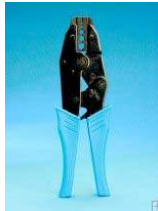
Crimping Tool Frame Only