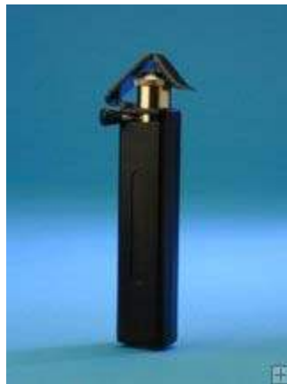
Round Cable Stripper

Die for Barrel Type Connectors 22-12 AWG Non Insulated