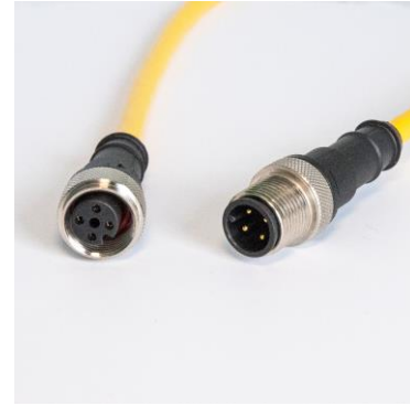
Male and Female 4-pole