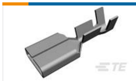
TE Part #1544132-2 CLIP 6,3 SECU 0,35