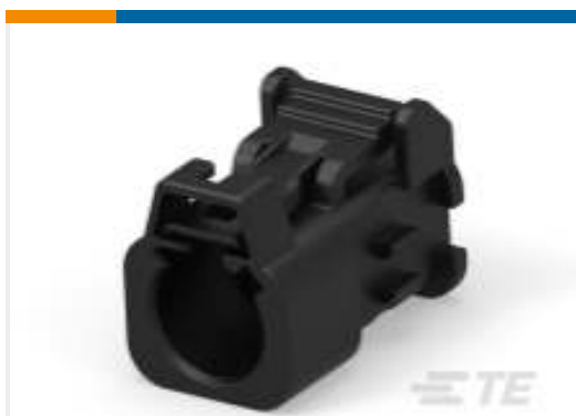
TE Part #2138710-1 PLUG HOUSING, 1 POSITION, 180