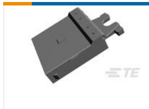
TE Part #284803-1 9 POS. MQS PIN HOUSING