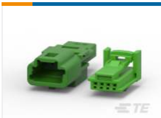
TE Part #1379675-1 TH/.025 CONNECTOR SYSTEM, HOUSING