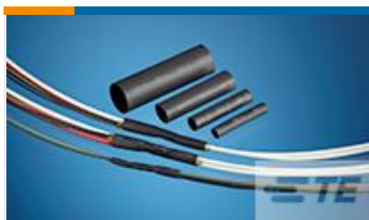
TE Part #2525592005 RBK-ILS-125-NR1-0-STK