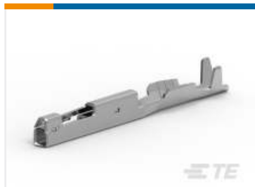
TE Part #1-2177908-1 MCON 0.50 TERMINAL