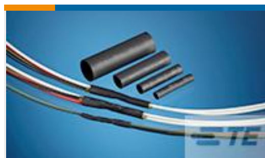
TE Part #0021032009 RBK-ILS-125-NR3-0-STK