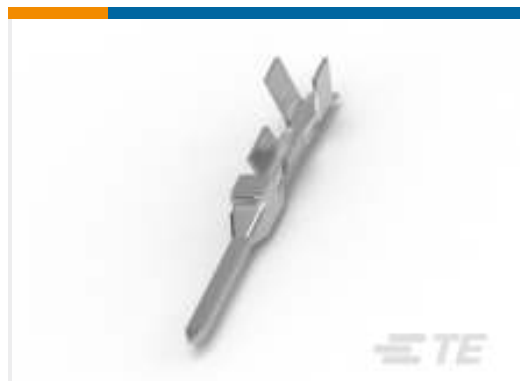
TE Part #1897724-1 040 TAB CONTACT