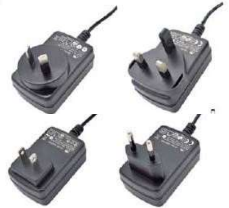
*Product images are for illustrative purposes only and may vary from actual design.