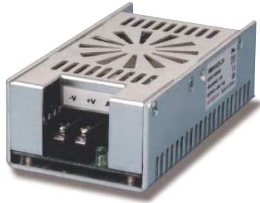
2.5"W x 4.75"L x 1.5"H