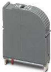
Type 2 arrester replacement plug (surge arrester) with high-capacity varistor with low leakage current.

Please be informed that the data shown in this PDF Document is generated from our Online Catalog. Please find the complete data in the user's documentation. Our General Terms of Use for Downloads are valid ( http://download.phoenixcontact.com )