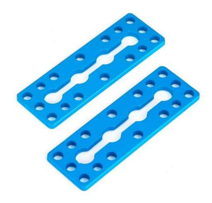
Plate 0324-072-Blue (Pair)