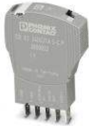
Electronic device circuit breaker, 1-pos., active current limitation, status output and control input, plug for base element.

Please be informed that the data shown in this PDF Document is generated from our Online Catalog. Please find the complete data in the user's documentation. Our General Terms of Use for Downloads are valid ( http://download.phoenixcontact.com )