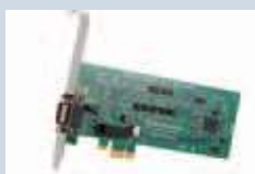
PX-387: PCIe 1xRS422/485 1MBaud Opto Isolated