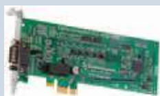
PX-376: LP PCIe 1xRS422/485 1MBaud Opto Isolated