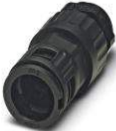
Cable gland, metric thread, IP66 protection, with strain relief

Please be informed that the data shown in this PDF Document is generated from our Online Catalog. Please find the complete data in the user's documentation. Our General Terms of Use for Downloads are valid ( http://phoenixcontact.com/download )