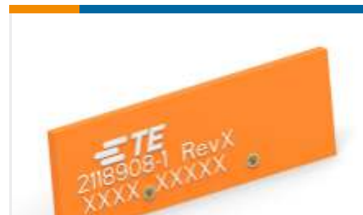
TE Part #2118908-1 PCB WLAN TRIPLE BAND BULK PACKAGED