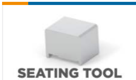
TE Part # 2018524-1 TOOL, SEAT 4 PR 10 COL,BP CONN