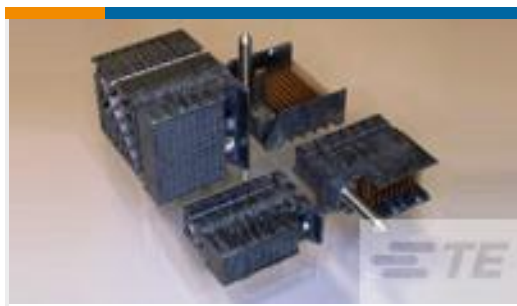
TE Part #2007809-1 IMP100S,H,V4P10C,LG,OEWS39,4.5