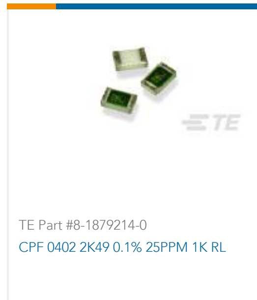
TE Part #8-1879214-0 CPF 0402 2K49 0.1% 25PPM 1K RL