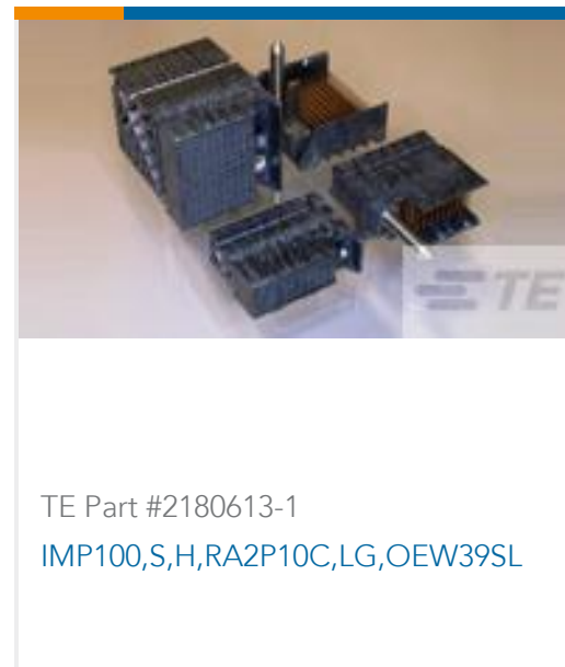
TE Part #2180613-1 IMP100,S,H,RA2P10C,LG,OEW39SL