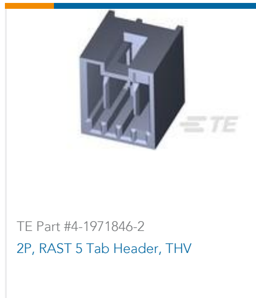
TE Part #4-1971846-2 2P, RAST 5 Tab Header, THV