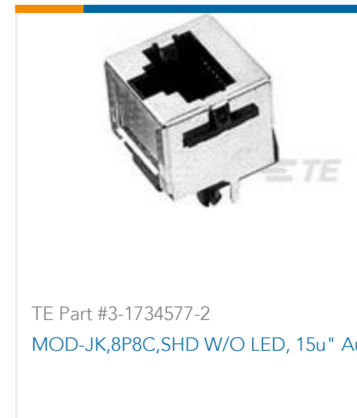
TE Part #3-1734577-2 MOD-JK,8P8C,SHD W/O LED, 15u" Au