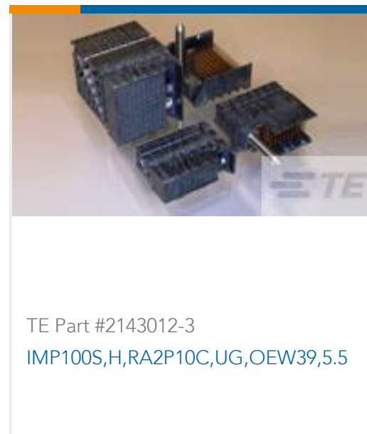
TE Part #2143012-3 IMP100S,H,RA2P10C,UG,OEW39,5.5