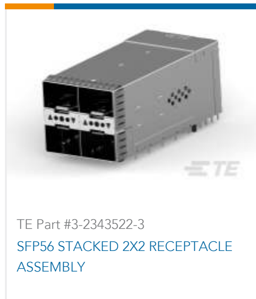
TE Part #3-2343522-3 SFP56 STACKED 2X2 RECEPTACLE ASSEMBLY