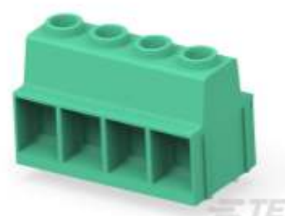
TE Part # 1986713-4 PWR TB DBL PIN 4P, 15.00 PCB