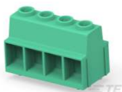
TE Part # 1986714-4 PWR TB 2PIN 4P, 15.00 PCB W/PEG