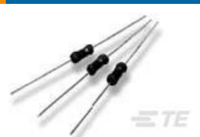
TE Part #8-1879354-3 RR03 5% 820R AMMO