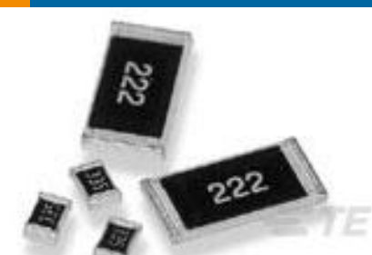
TE Part #1623022-1 CRG0603 5% 10K