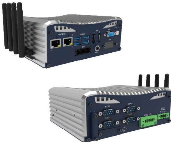
Models shown with Optional Antennas Kit

6th Generation Intel® Core™ U Series Processor Fanless Box Computer, 2x RJ45 GbE