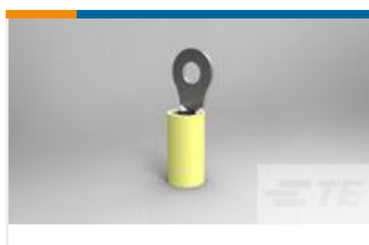
TE Part #35108 TERMINAL,PIDG R 12-10 8