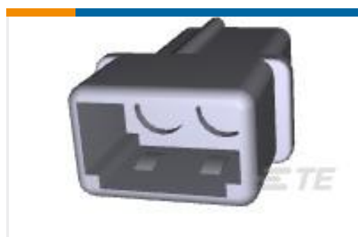
TE Part #1-480319-9 02P CMNL CAP HSG F/H BLK