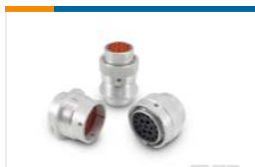
TE Part #HD34-24-23PN DEUTSCH HD30 Housings