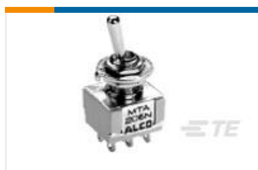
TE Part #6-1437558-8 MTE106D=(MSTE) SW TOG WATERPRO