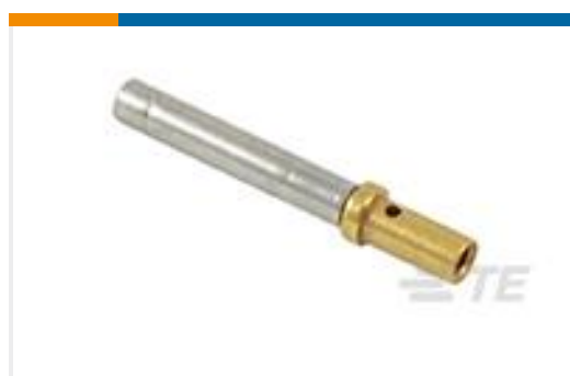
TE Part #0462-201-2031 SOC, SOLID, SIZE 20, 20AWG, AU