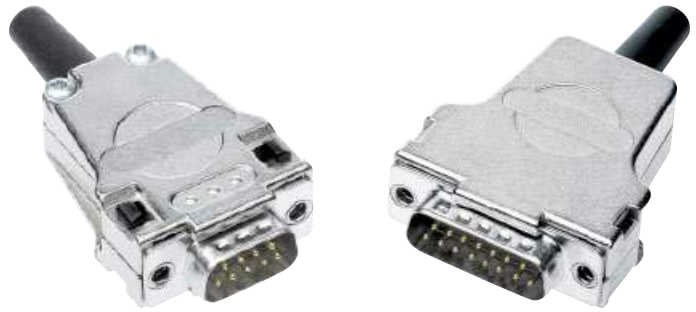
Full metal top entry hoods with premounted threaded inserts

Identification No. of contacts Part number Drawing Dimensions in mm