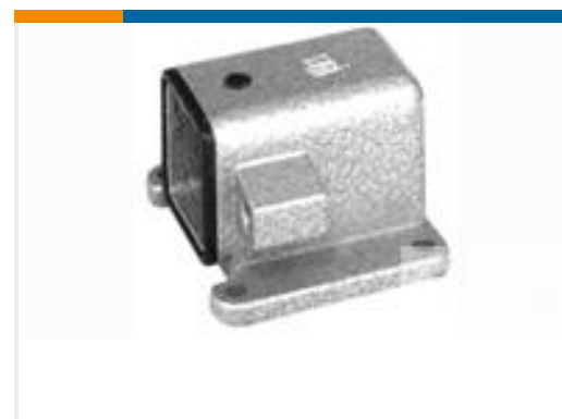
TE Part #2-1102602-5 HIP-K.3/4.SGF