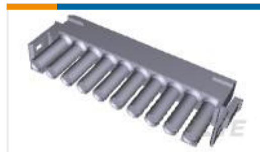
TE Part #926302-1 10& UNIV.M-N-L.PLUG