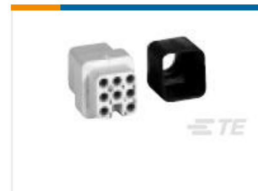
TE Part #2-1103103-3 HN.D.7.BU.C