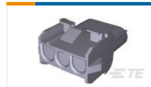
TE Part #350767-1 03P UMNL CAP HSG V0