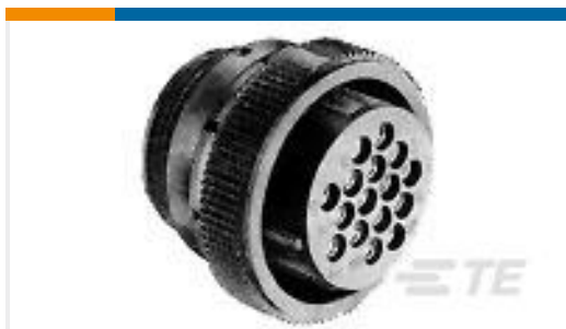
TE Part #182649-1 17-14 CPC PLUG RS