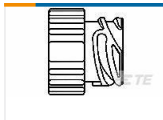
TE Part #185636-1 PROTECT CAP 2.5MM PLUG