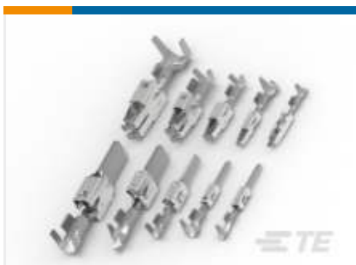
TE Part #927775-3 TIMER, RECEPTACLE AND TAB