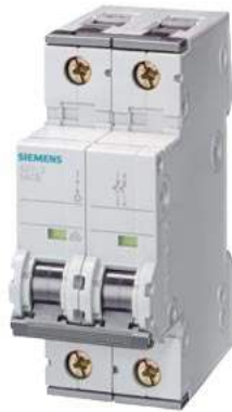
Miniature circuit breaker 400 V 10kA, 2-pole, A, 25A, D=70 mm