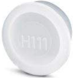
The figure shows the product version for M23 circular connectors

Plastic dust protection cap for connectors with M17 knurled nuts and M17 Speedcon knurled nuts