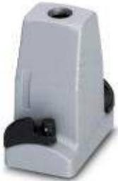
HEAVYCON ADVANCE EMV sleeve housing B6, with bayonet locking, height 100 mm, with 1x M20 thread, straight cable outlet

Please be informed that the data shown in this PDF Document is generated from our Online Catalog. Please find the complete data in the user's documentation. Our General Terms of Use for Downloads are valid ( http://download.phoenixcontact.com )