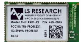
Actual size (23 mm x 41.4 mm)