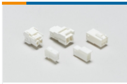
Rectangular Power Connectors(244)