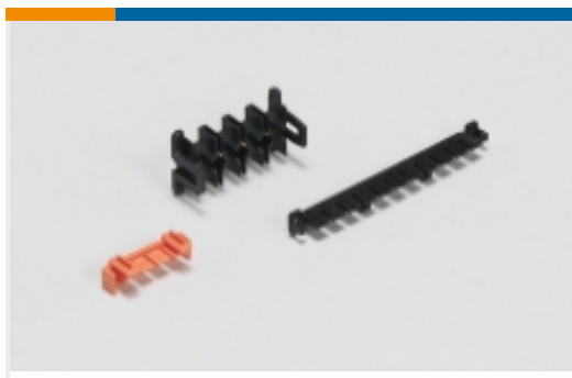
Rectangular Connector Locking(2)