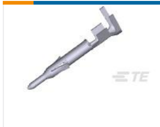
TE Part #170364-1 MINI UNIVERSAL M-N-L PIN LP